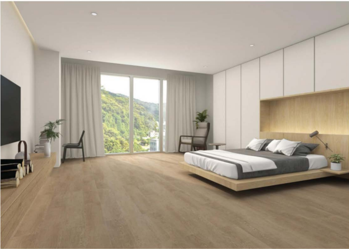
DEV705 - William Desert

*LV crossover sku = DLV04 - Gershwin Grey