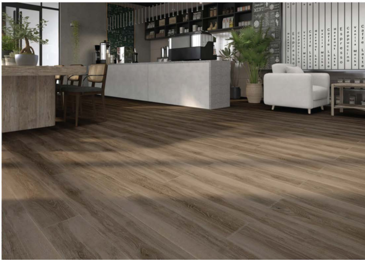
DEV701 - Rod Iron Wolfgang