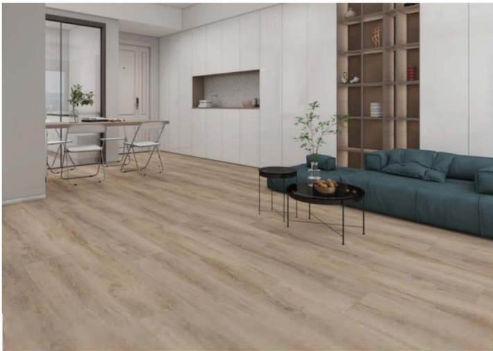
*LV crossover sku = DLV909 - Grande Grey