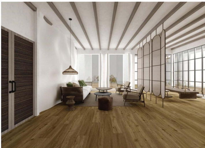
DEV702 - Ludwig Beige

*LV crossover sku = DLV701- Midnight Mozart