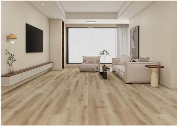
*LV crossover sku = DLV707 - Mercury Mist