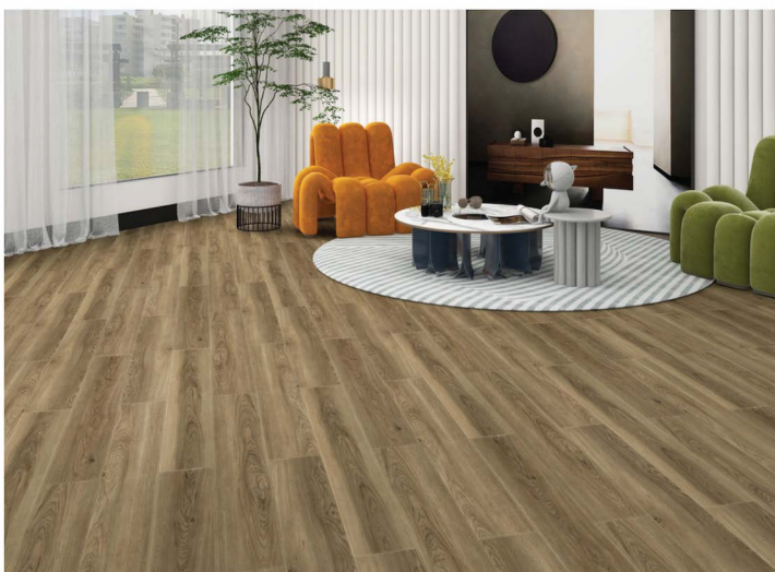
DEV703 - Johann Brown

*LV crossover sku = DLV702 - Beethoven Beige