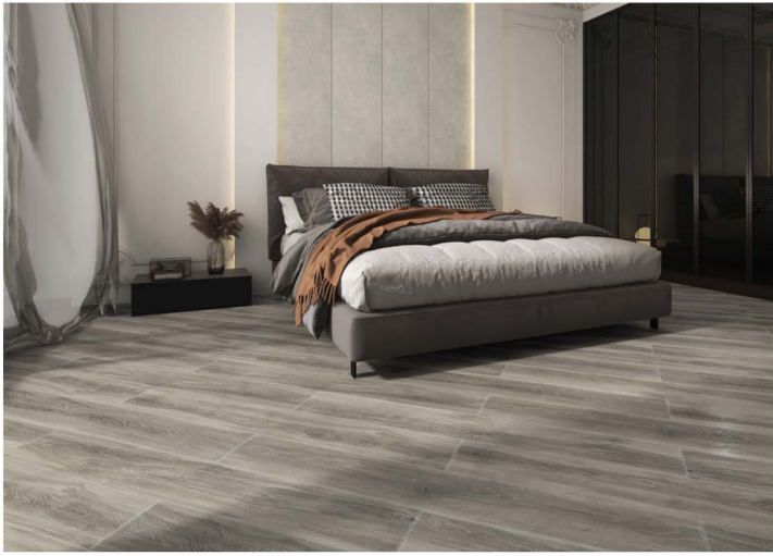
DEV704 - George Grey