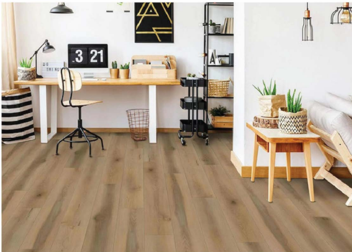
DEV706 - Fredrick Maple

*LV crossover sku = DLV705 - Coastal Byrd