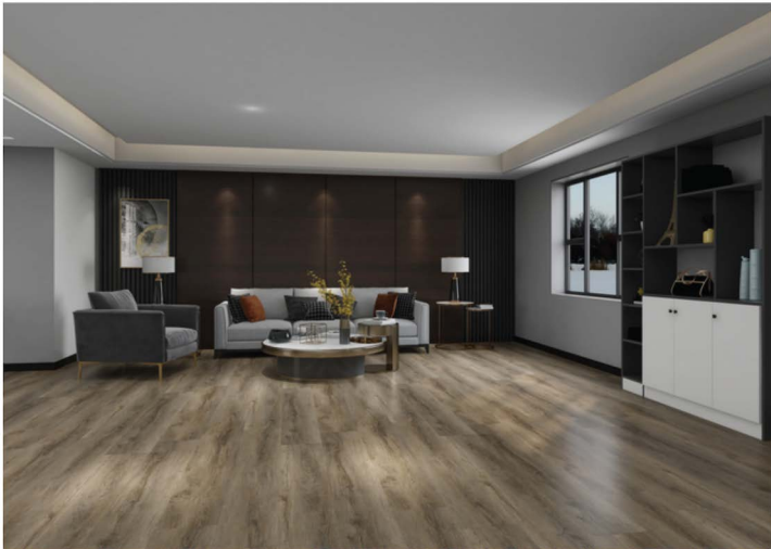
*LV crossover sku = DLV 908 - McCartney Mocha