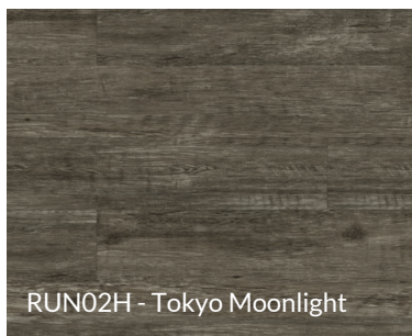
RUN02H - Tokyo Moonlight