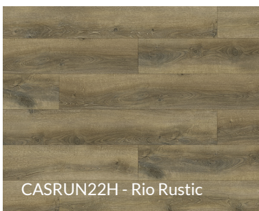
CASRUN22H - Rio Rustic