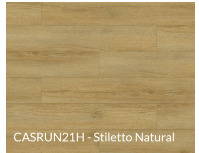
CASRUN21H - Stiletto Natural