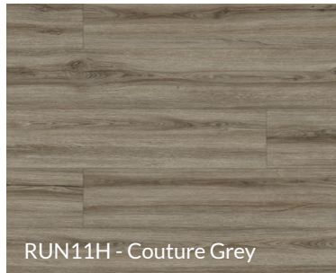
RUN11H - Couture Grey