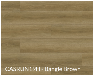
CASRUN19H - Bangle Brown