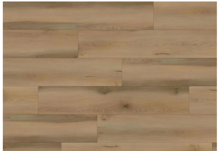
DEV706 - Fredrick Maple