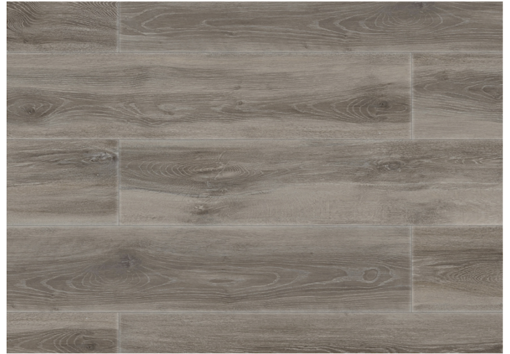
DEV704 - George Grey