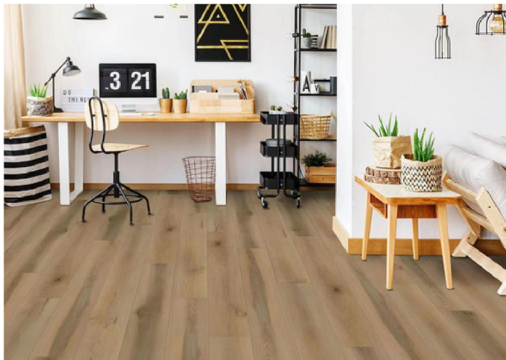
*LV crossover sku = DLV706 - Chopin Maple