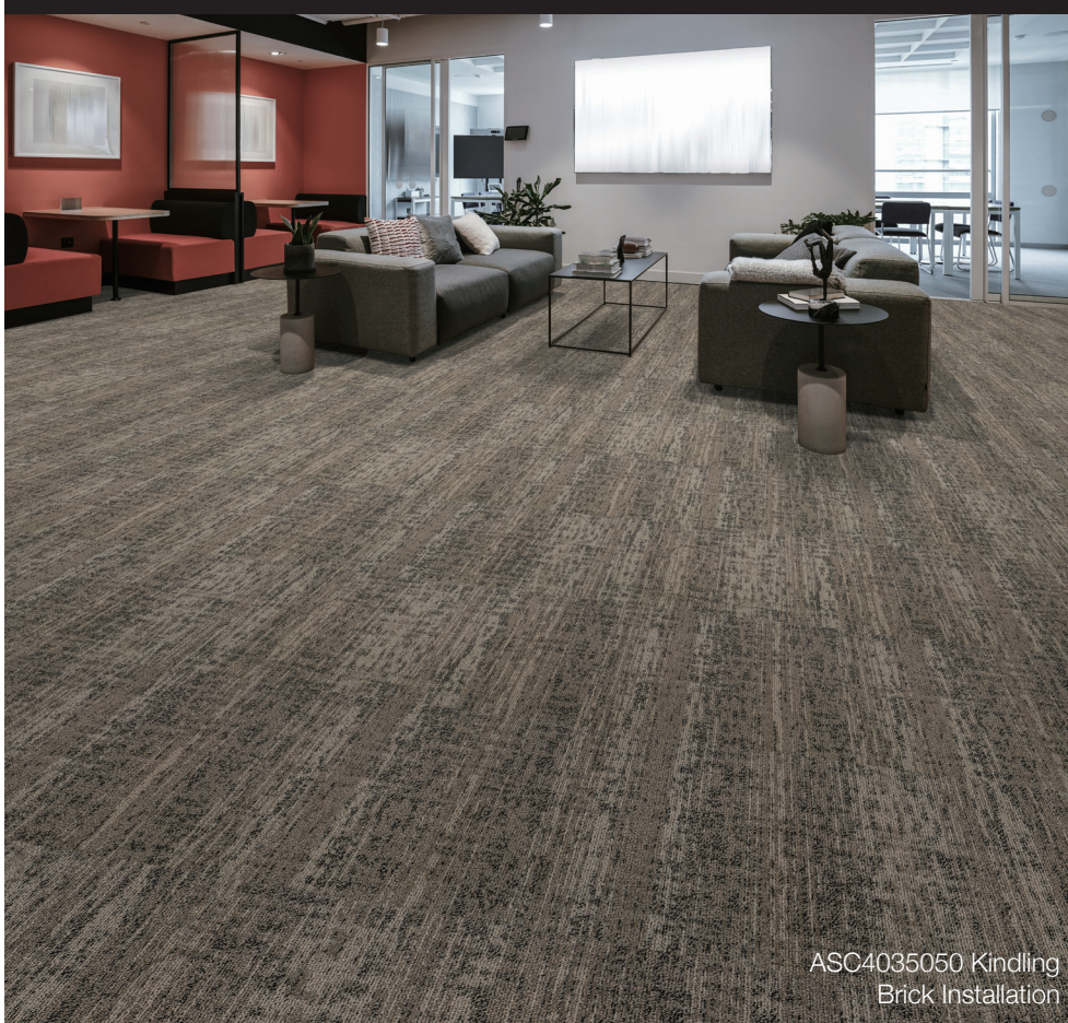
ASC4035050 Kindling Brick Installation