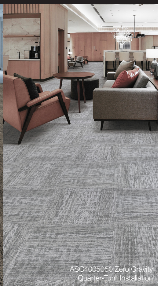
ASC4005050 Zero Gravity Quarter-Turn Installation