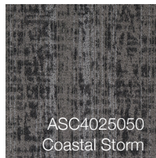
ASC4025050 Coastal Storm